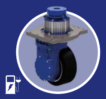
Spicer Electrified<sup>™</sup> Motor Drive Unit (MDU)

Warehouse Forklift Trucks can operate manually or autonomously (Automated Guided Vehicles). They are playing a larger role in increasing throughput and minimizing infrastructure in warehouses and factories. We offer zero-emissions electric-driven solutions with advanced controls that optimize productivity, accuracy, and worksite safety.