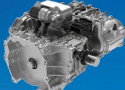
Modular High-Performance Hybrid 8-Speed Dual Clutch Transmission