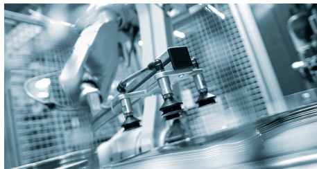
Highly automated production lines minimize lead time and cost.