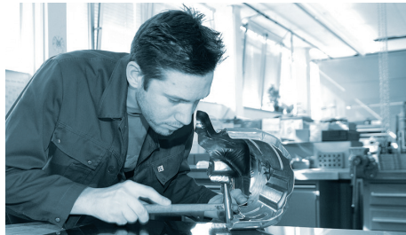
In-house craftsmanship capability provides rapid prototypes.