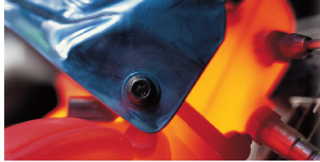
Dana TAPS offers the protection you need for tough under-the-hood environments.